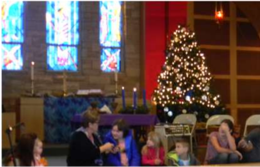
Time with Children