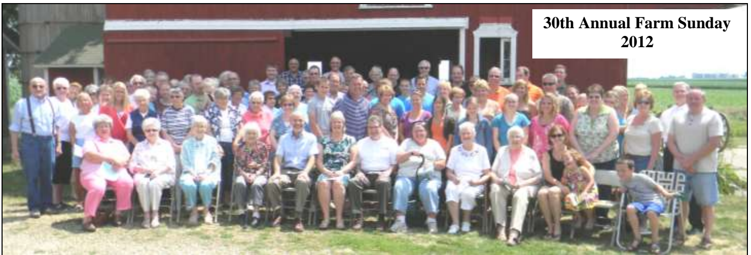
30th Annual Farm Sunday 2012

Watch calendar, website and bulletins for upcoming committee meetings